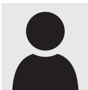
Kashanna Fair (2013 recipient)